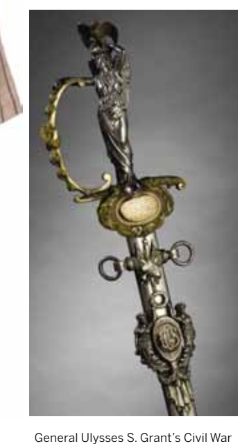
Presentation Sword as "General in Chief of the United States Army 864". Sold for $1,673,000 in June 2007

and your website came up, along with another company. I called the other company and they said to take the coins to the post office and put them in a box and mail them to us registered mail. They said, 'We'll call you and let you know if you have anything good.' Then I called you people, and 24 hours later you're sitting in my living room."