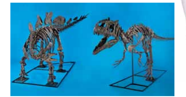
The Fighting Pair - Allosaurus vs. Stegosaurus. Sold for $2,748.500 in June 2011.