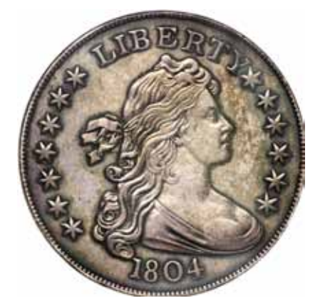
1804 $1 Original PR62 NGC, The "King of American Coins," The Mickley-Hawn-Queller 1804 Silver Dollar, Class I Original, PR62 NGC. Sold for $3,737,500 in April 2008.