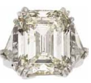
Diamond, Platinum Ring. Sold for $388,375 in December 2010.

1927 Lou Gehrig Game-Worn New York Yankees Jersey. Sold for $717,000 in November 2010.